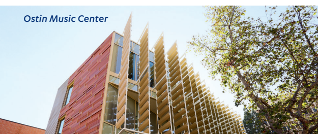
Ostin Music Center

Digital Humanities Film, Television and Digital Media Visual and Performing Arts Education