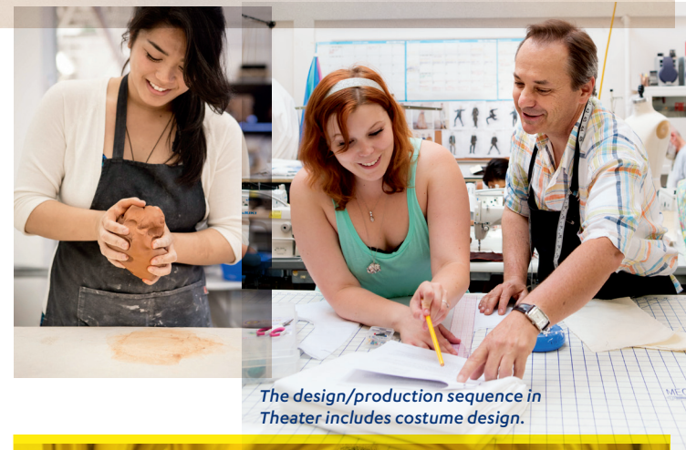
The design/production sequence in Theater includes costume design.

FILM AND TELEVISION ARCHIVE. In the U.S., UCLA's archive is second in size only to the Library of Congress. But it's not just for film buffs. It's a rich cultural history resource that includes the Hearst Metrotone News collection, with 27 million feet of newsreel footage from 1914 through 1968. Undergraduates can view holdings for research papers or capstone projects.