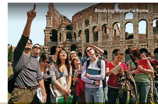
Studying abroad in Rome

Many UCLA students earn course credit outside the U.S. UCLA offers 100+ programs in more than 40 countries. Financial aid can help make study abroad affordable.