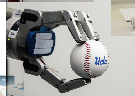
Robotics and Cyberphysical Systems researchers use machines to grasp the future.