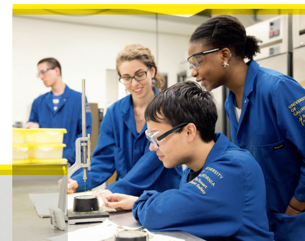
The Concrete Lab is a research and instructional space for Civil and Environmental Engineering.

A sampling of majors (see pages 14–15 for a complete list):