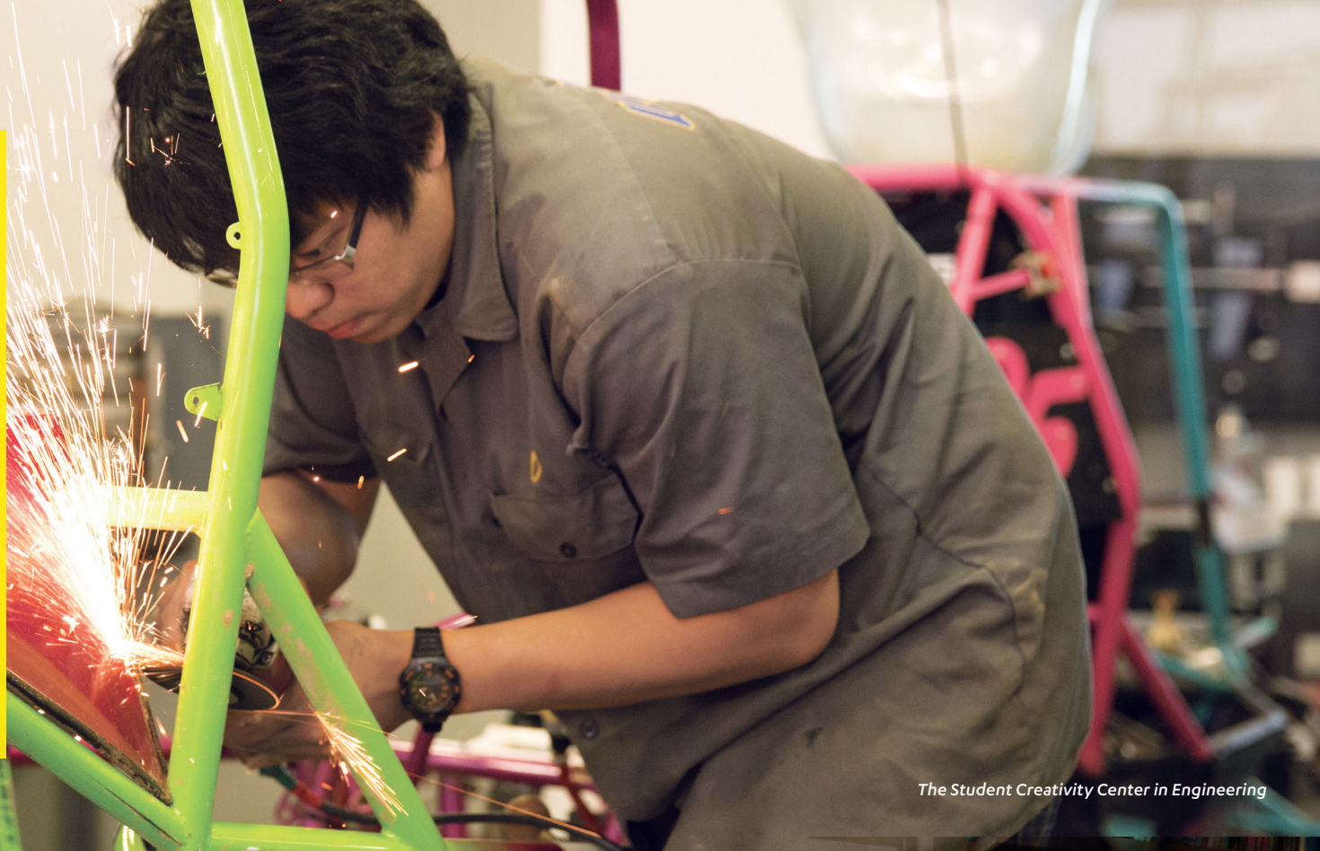
The Student Creativity Center in Engineering

If you have a talent for numbers or you like to take things apart — with your hands or in your imagination — you may find your major in the PHYSICAL SCIENCES or ENGINEERING .