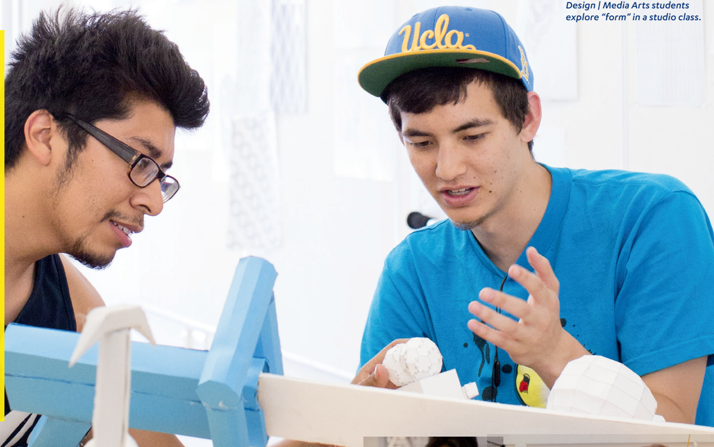
Design | Media Arts students explore "form" in a studio class.

Perhaps your passion is theater or painting. Or maybe you are thrilled by literature or language as a reader or a writer. You may find your major in MUSIC , the ARTS or the HUMANITIES .