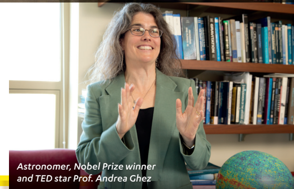
Astronomer, Nobel Prize winner and TED star Prof. Andrea Ghez

INFINITY AND BEYOND. Faculty and alumni are involved with many NASA missions, from Dawn to Mars 2020 to Europa Clipper. Astronaut Megan McArthur '93 was the robotics expert on the final space shuttle mission to the Hubble Telescope; today, she is the pilot of the NASA SpaceX Crew-2 mission to the ISS, launched on April 23, 2021. Undergraduate students designed, built and launched the ELFIN satellite to conduct research into space weather.