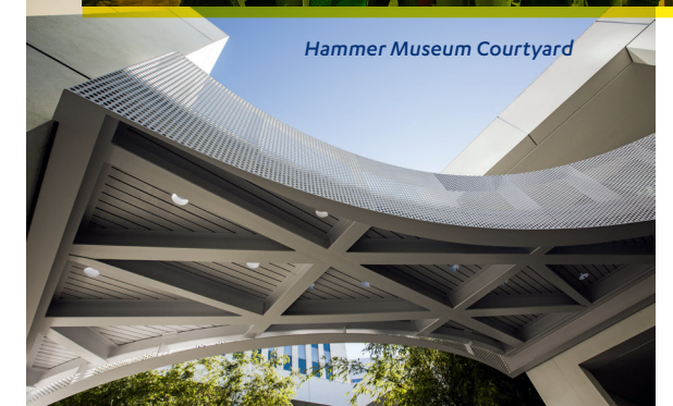
Hammer Museum Courtyard